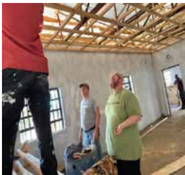
Putting up ceiling boards