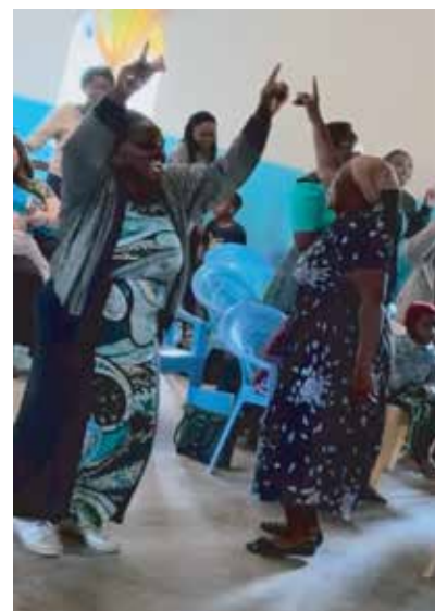
Singing and dancing