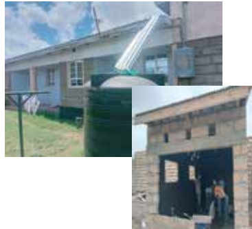
Kitchen under Construction