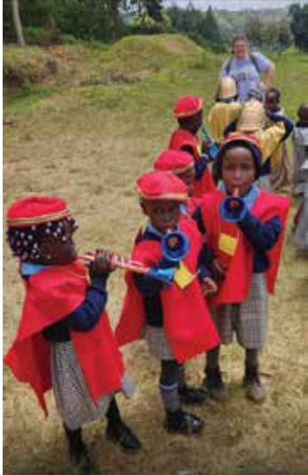
Bible Theme Skits