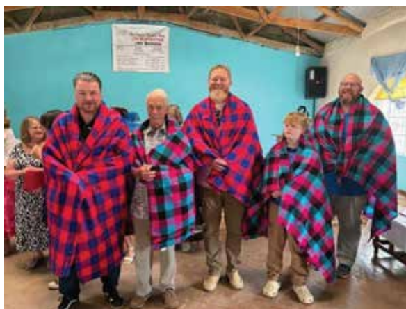
Church gave all our Men Maasi Blankets