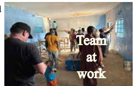
Team at work