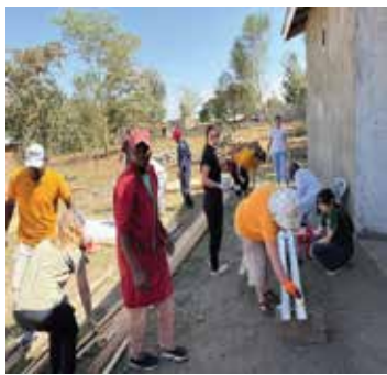
Painting trim before installing