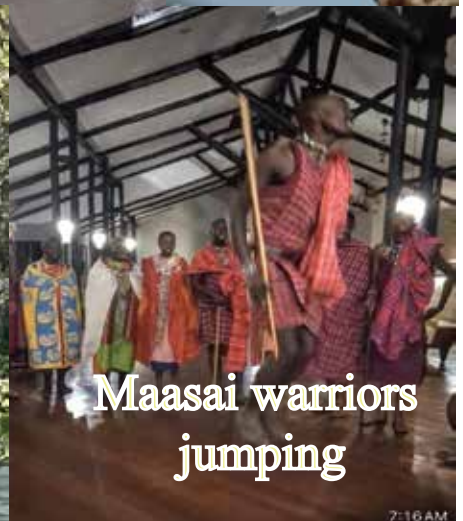
Maasai warriors jumping