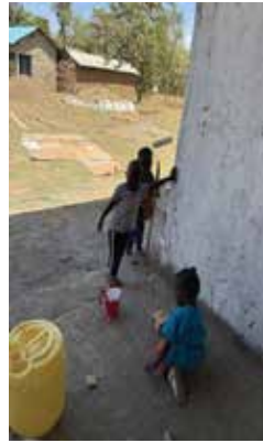
Church kids wanted to help